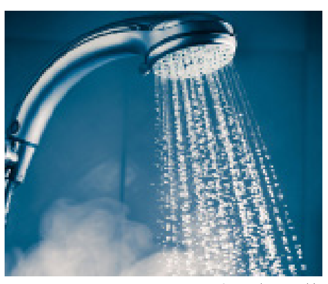
Steam shower cabin